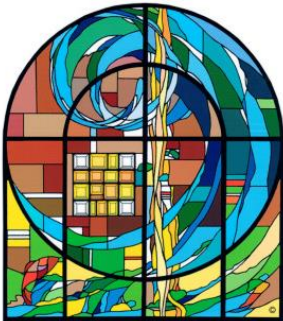
The Church of St. Benedict Avon, MN